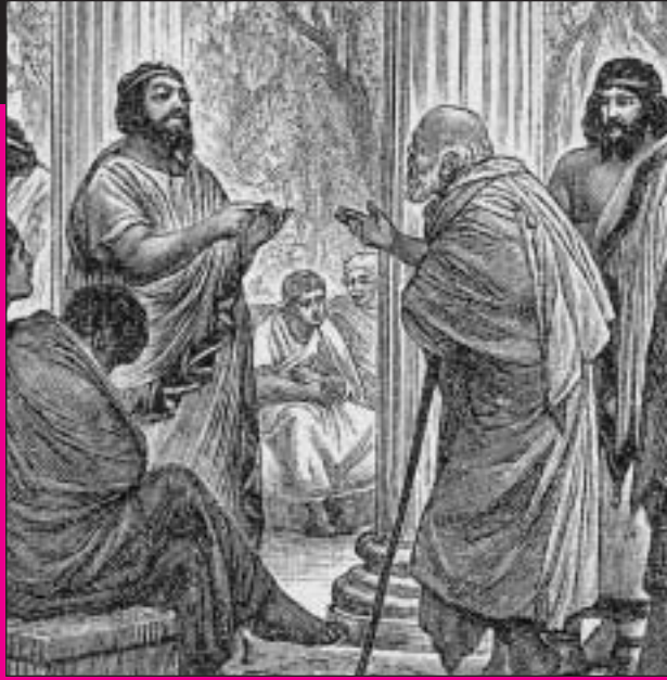
In Classical Athens, education was the birthright of the citizen, to be pursued throughout life.