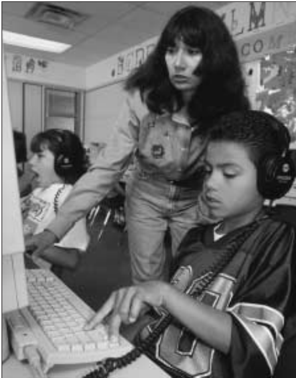
Learning to use a computer in school is an example of schooling that can help achieve a good education as well as a program of training.

Because of these differences between training and education, we typically think of training as preparing a person for a specific social or economic role, while education seeks to prepare an individual for a wide range of roles. For example, we typically speak of a nurse's training or a boxer's or a musician's training, emphasizing by this term the skills and understandings needed for each specific role. To be educated, however, is to develop a wide range of human capacities that equip one to fill a variety of roles in one's culture: as a worker, a citizen, a parent, a person who relates ethically to others, a person who uses leisure in productive ways, and so on. Think about it: would you rather be trained or educated—or both?