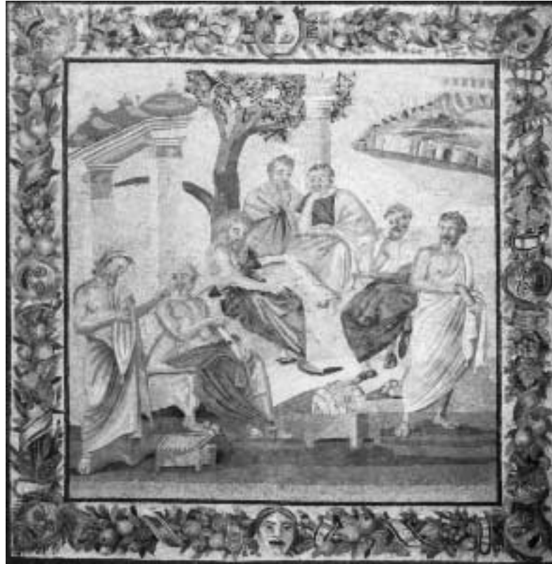
Plato taught at the school he founded, the Academy, with the aim of developing an ideal balance of reasoning powers, emotional moderation, and physical fitness.

riculum consisted of gymnastics, literature, and music. Those who could afford further schooling from private teachers—and those lucky enough to find teachers like Plato, who taught free of charge—went to secondary school from age 14 to age 18. There they continued their work in gymnastics, literature, and music but studied dialectic and philosophy as well. From age 18 to age 20, military training was compulsory for all males. The city-state's security, after all, depended on its ability to defend itself against enemy states.