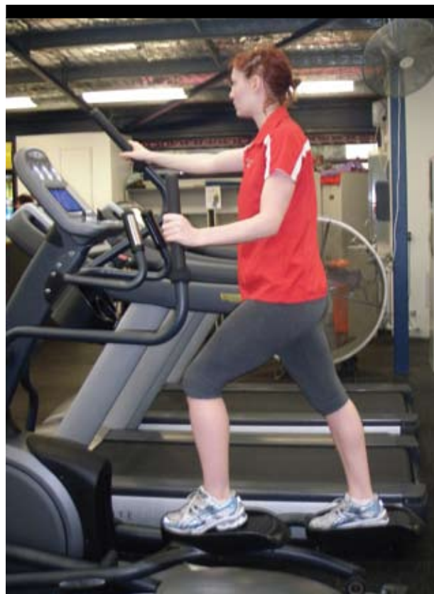
▲ FIGURE 1.5 Elliptical trainer works both arms and legs during endurance training

Anaerobic training is shorter than aerobic training in duration (less than two minutes), in which oxygen is not a limiting factor in performance, and requires energy from anaerobic sources (ATP and lactic acid systems). Anaerobic training is all about shorter explosive movements and will help build power and speed.