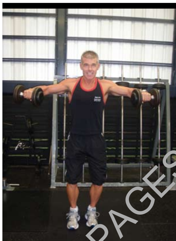
▲ FIGURE 1.4 Flye exercise using free weights (dumbbells)

Isometric training, however, is not sufficient on its own and needs to be combined with isotonic training.