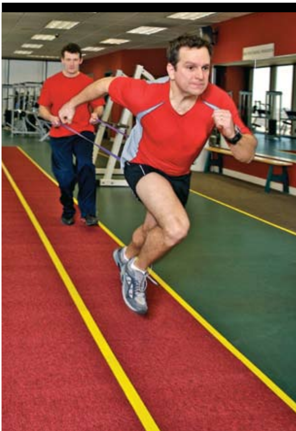
FIGURE 1.6 ▼ Resistance belt improves power and speed

Speed is the quickness of movement of a limb, whether this is the legs of a runner or the arm of the shot putter. Speed is an integral part of most sports and