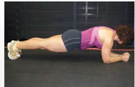
Example of an isometric exercise