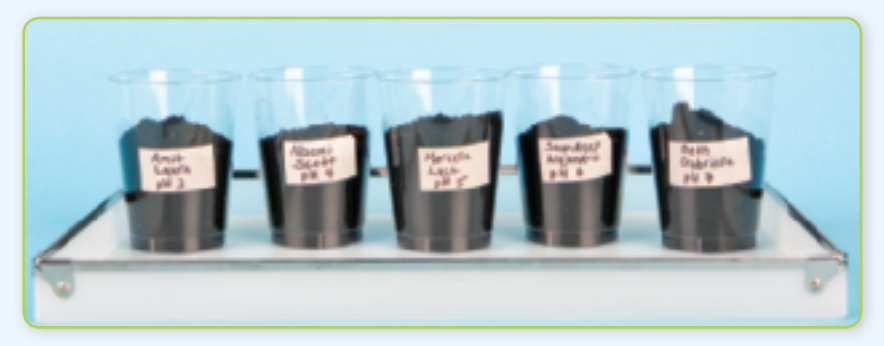
How are plants affected by acid rain?

Make a hypothesis about how the plants will respond to increasing levels of acidity in the soil and water.