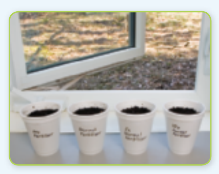
Fertilizer is beneficial to plants, but how much is too much?