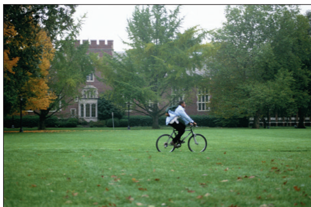
FIGURE FOR EXERCISE 42

42. Commuting students. At a well-known university, \frac{1}{4} of the undergraduate students commute, and \frac{1}{3} of the graduate students commute. One-tenth of the undergraduate students drive more than 40 miles daily, and \frac{1}{6} of the graduate students drive more than 40 miles daily. If there are twice as many undergraduate students as there are graduate students, then what fraction of the commuters drive more than 40 miles daily?