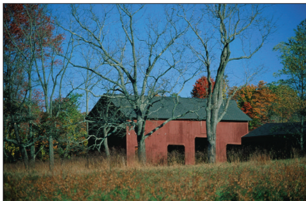
FIGURE FOR EXERCISE 64