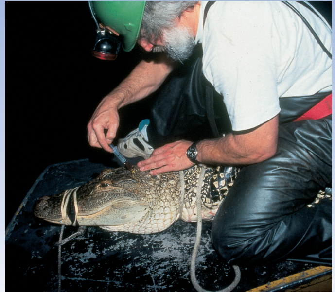
Catching alligators is a job best done at night. Alligators in Florida lakes, like the one shown here in the hands of Professor Guillette, seem to be experiencing developmental abnormalities, perhaps due to pollution of many of Florida's lakes by endocrine-disrupting chemicals.

The androgen-dependent sexual development of alligators provides a sensitive barometer to environmental pollution, because the androgen response can be blocked by a class of pollutant chemicals called endocrine disrupters. When endocrine-disrupting pollutants contaminate Florida lakes, their presence can be detected by its impact on the sexual development of the lakes' resident alligators. Just as the death of coal miners' canaries warn of the buildup of dangerous gas within the shaft of coal mines, so disruption of the sexual development of alligators can warn us of dangerous chemicals in the environment around us.