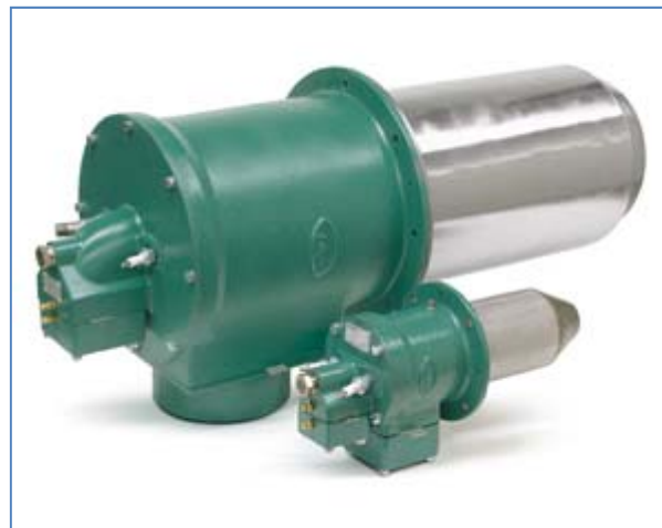
Figure 1 Eclipse burner