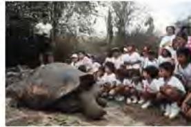
Las Islas Galápagos