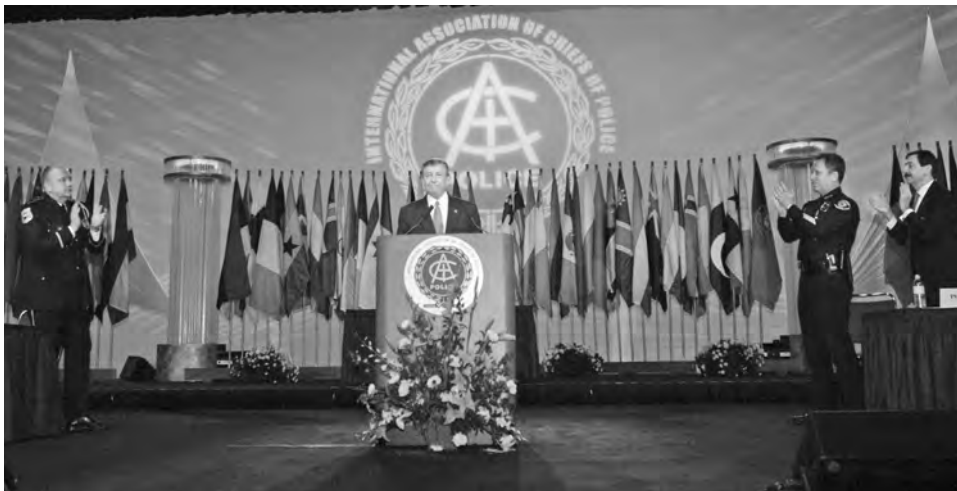
U.S. Attorney General John Ashcroft addressing the 111th International Association of Chiefs of Police (IACP) Annual Conference at the Los Angeles Convention Center.

an occupation or discipline that requires its members to adhere to prescribed standards of behavior and competence and that has characteristics including common goals and principles, a common language, a system for licensing or credentialing members, and an association that promotes the profession's standards and interest.