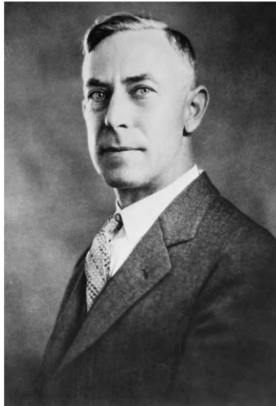
Chief August Vollmer of Berkeley, California, was subsequently appointed professor of Police Administration at the University of Chicago. Vollmer's innovations were shared with police agencies around the world.