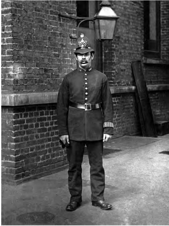
A nineteenth-century police officer walks a beat.

The commission ushered in a period when police authority derived more from the law than from local politicians. In addition, police activity shifted from community service to crime control and prevention. Most law