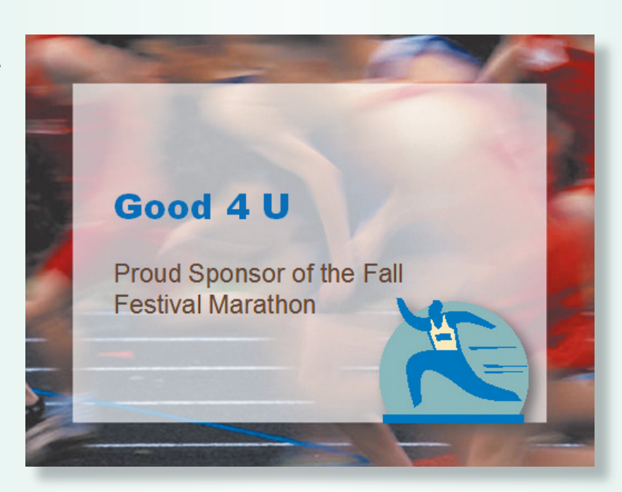
Figure U2-1 Completed title slide

7. Working in the Outline pane, key the text shown in Figure U2-2, inserting new slides where needed.