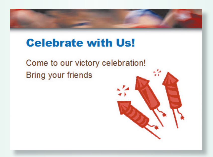
Figure U2-3 Finished slide with rotated picture

10. Insert a new slide after slide 4 that uses the Blank layout . Insert a clip art image of a race. Resize the picture proportionately so it almost fills the open space on the slide. If the picture is an odd size, crop it where necessary so it is the same size and shape as the slide. Adjust the picture's brightness settings to soften the colors so WordArt will be readable when placed above the image.