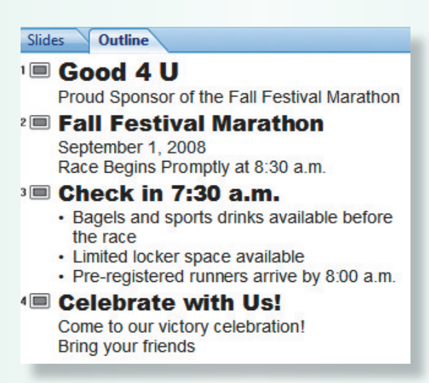
Figure U2-2 Presentation data