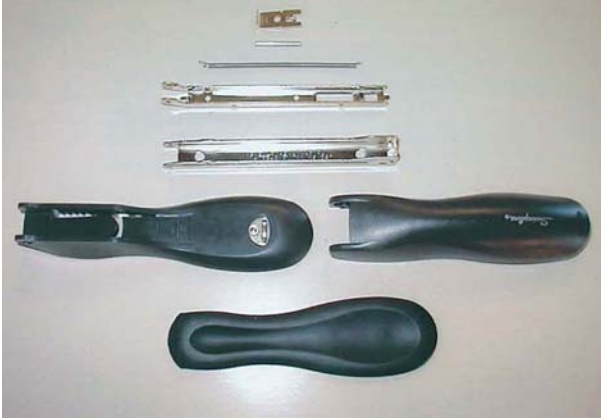
Figure 1B Parts to be Sketched