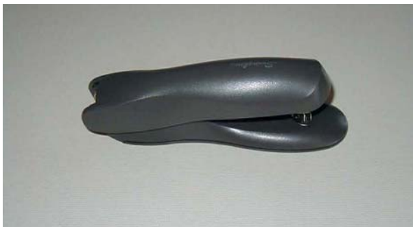
Figure 1A Desktop Stapler for Design Project

One of the best ways to learn engineering design graphics principles and to use 3-D modeling tools is to use a real object to simulate the process. When the author first learned CAD, he used this technique using a road bike. There are a number of inexpensive products that could be used for this exercise that can easily be purchased at stores, such as a disposable camera, mechanical pencil, or various tools. For this exercise you will be using a stapler like that shown in Figure 1A. The stapler in the figure is a Swingline Desktop Stapler #81800 that can be purchased at popular retail stores, such as Wal-Mart, Kmart, and Staples. If you wish to avoid having curved surfaces, Swingline desktop Stapler #74700 can be used. You will be assigned to teams to purchase a stapler, disassemble the item, measure the parts, create the design sketches, make simple design changes, model the parts, create working drawings for manufacturing, perform simple assembly analyses, and create rendered models of the assemblies.