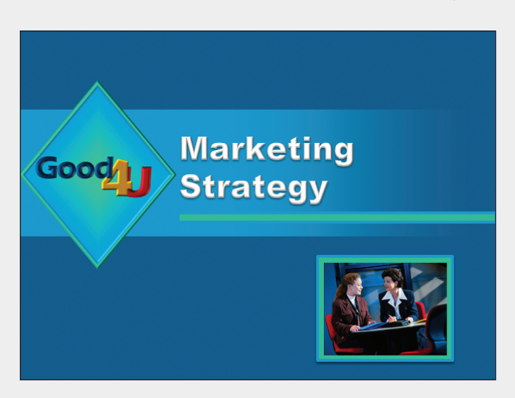
Figure 4-45 Drop shadow effect