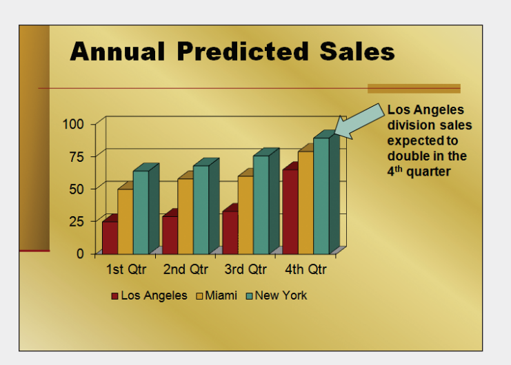
Figure 4-43 Adding a text box to clarify an important point