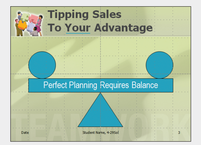
Figure 4-41 Drawing shapes