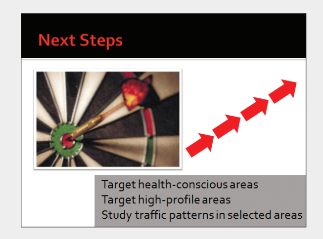
Figure 4-47 Completed slide

12. On slide 5, draw a Right Arrow shape, and rotate it so that it points up slightly. Change the shape fill and shape outline to Red , and resize if necessary. Duplicate this arrow by pressing Ctrl + D , and position the second arrow above the first one. Repeat for two more arrows. The arrows should angle up, as shown in Figure 4-47.