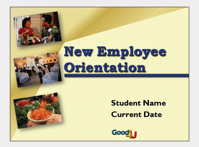
Figure 4-46 Positioning of pictures