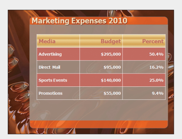
Figure 5-34 Table slide