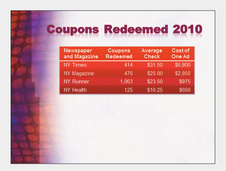
Figure 5-29 Completed table slide