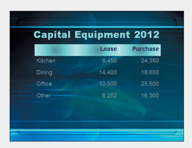
Figure 5-25 Table text in completed table