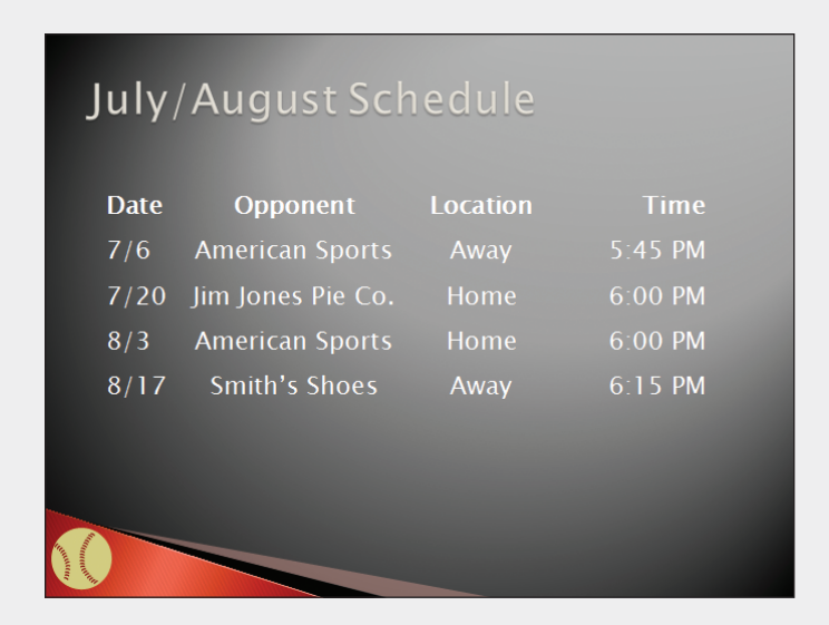
Figure 5-32 Slide 2