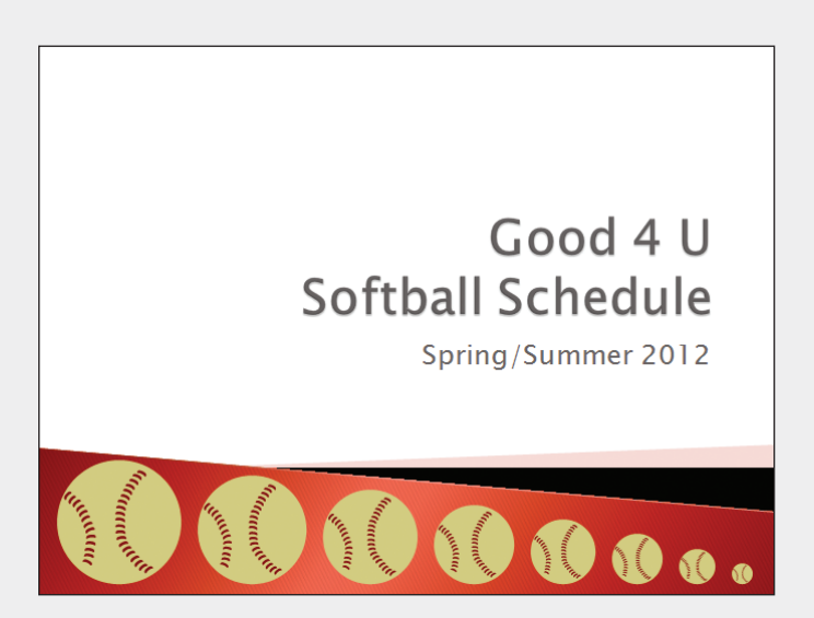
Figure 5-31 Slide 1