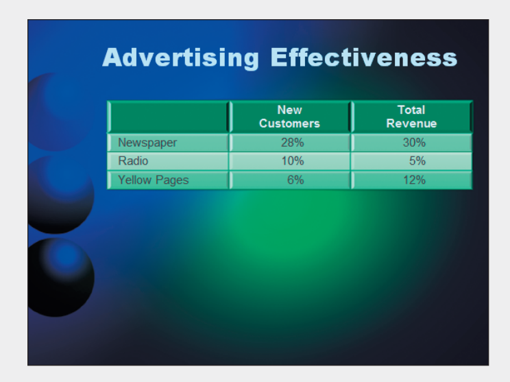
Figure 5-30 Table text