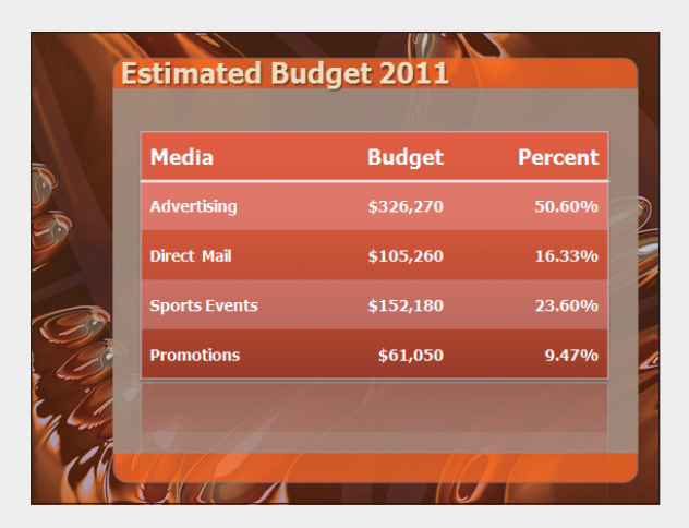
Figure 5-35 Table slide