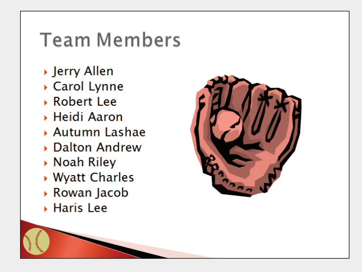
Figure 5-33 Slide 3