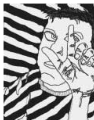
Figure 18 Student work.

Step 1 Create a variety of original patterns on the computer using a draw or paint program. See Patternmaking Approaches on the next page. Remember that patterns are made through the repetition of line, shape, color, and value. Save these patterns in your folder for later use.