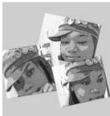
Figure 20 Student work.

Step 1 Collect photographs of yourself or examples of artwork from your portfolio. If needed, take photographs of yourself using a traditional or digital camera. These images will be used as part of the background in your stationery page design.