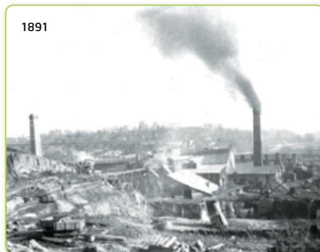
Figure 3.21 Ecological restoration has converted Toronto's Don Valley Brick Works (shown in 1891 and today) into a natural environment and cultural heritage park that includes wetlands, a boardwalk, a wildflower meadow, and restored historic buildings.

Inquiry Investigation 3-B, Balancing Populations and the Environment, on pages 118-120