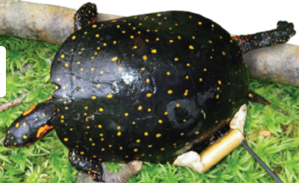
Figure 3.20 The radio transmitter on this spotted turtle, a rare species in Ontario, helps biologists learn more about its life history.

Just as rivets hold an airplane wing together, species hold ecosystems together. There are some special “rivets” that ecosystems cannot afford to lose, such as the keystone species you read about in Section 3.2. However, ecosystems tend to be over-engineered with lots of rivets too, especially rivets with high biodiversity. Most ecosystems might remain sustainable with the loss of one or two rivets, but as more rivets are lost, the ecosystems will lose their ability to sustain the remaining species, including humans.