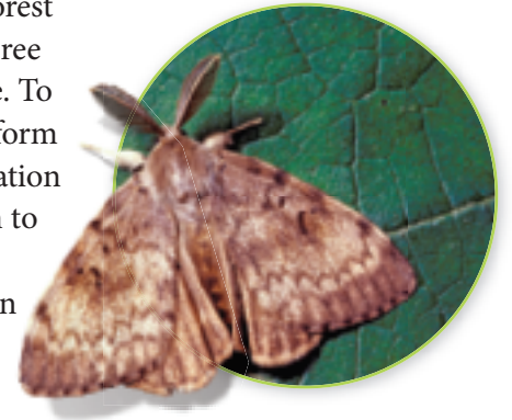
Figure 3.24 Gypsy moths can eat all the leaves on a tree.

biocontrol the use of a species to control the population growth or spread of an undesirable species