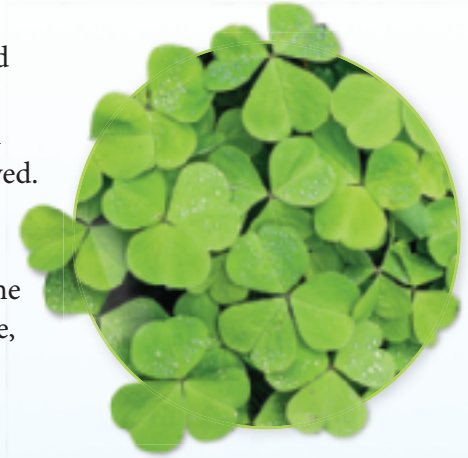
Figure 3.26 Clover is often planted to replenish nitrogen levels in soil.

Bioaugmentation is another restoration tool. Bioaugmentation is the use of organisms to add essential nutrients to depleted soil. For example, the clover shown in Figure 3.26 is often planted to replenish nitrogen levels in soil. Recall that nitrogen is an important nutrient for plants.