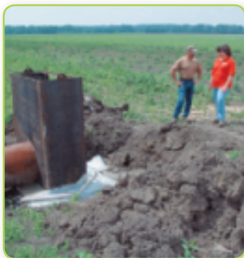
Figure 3.23 Water control structures are used by wetland conservationists to help restore and maintain water levels.