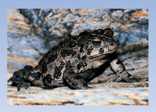
Disappearing amphibians. Populations of amphibians, like this Western toad ( Bufo boreas ) are declining in numbers in many regions.